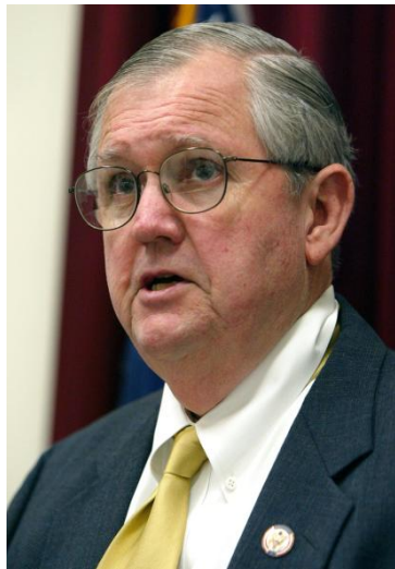
Rep. Norwood (R-GA)

Big News – Passage of 4 Norwood OSHA Reform Bills – 7/12/05